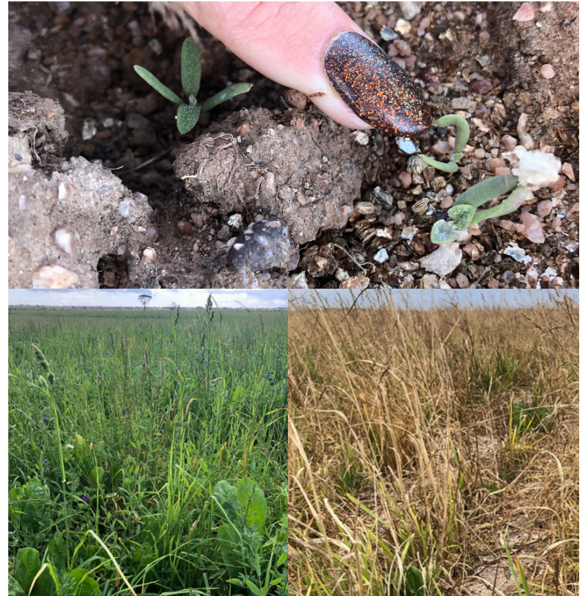
December 2022 (Three months after establishment)