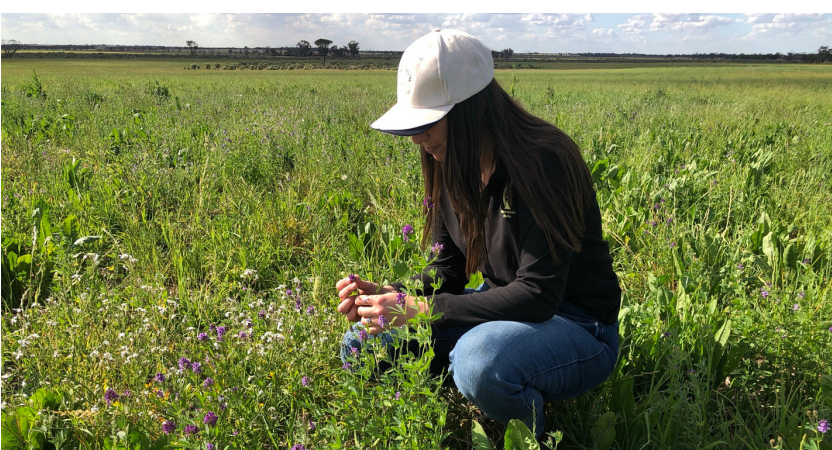
Gillamii Project Officer observing pasture establishment in October 2022

The outcome of these workshops were 4 different site designs and species mixes, two comprising of pastures with pre-established saltbush, one to be direct seeded with saltbush alleys and a pasture understory and the remaining to be planted with saltbush seedlings in alleys with a volunteer pasture understory.