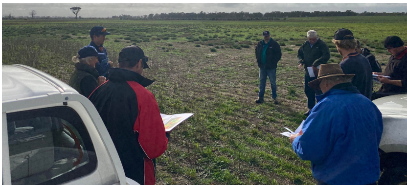
Core producers, DPIRD and Gillamii staff at one of the PDS sites discussing solutions

The sites are located throughout the Broomehill-Tambellup and Cranbrook shires, ranging from valley floors to areas further up the landscape in the transition zone of productive to salt affected soils. The motivation of producers to develop these areas into salt-tolerant pastures systems is to use both surface and ground water to manage the site's local salinity, while keeping the areas as productive paddocks, part of their various livestock enterprises.