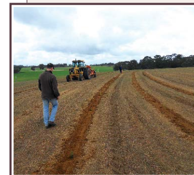
Good weed control prior to direct seeding and seedling plantings is preferable to relying on post-emergent selective weed control strategies, and provides the opportunity for bare-earth residual insecticide application to protect direct seeding germinants from red-legged earth mite predation.