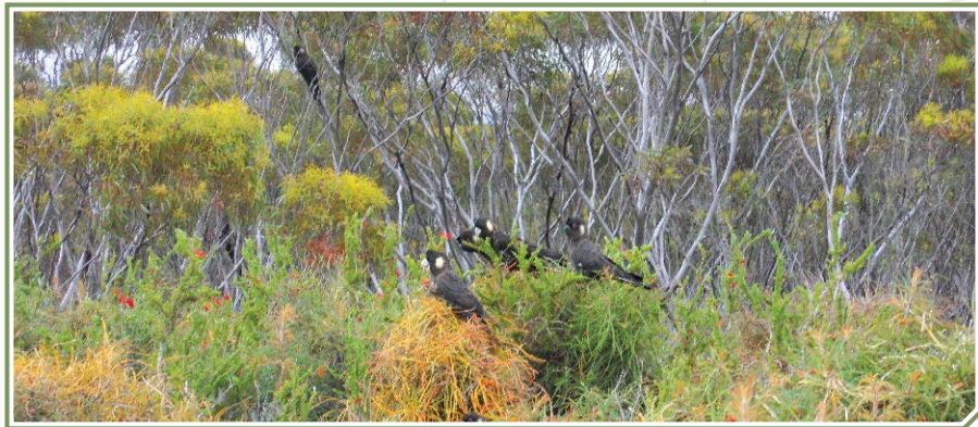
Where soil type and landscape position is suitable, revegetation that includes species such as banksias and hakeas can provide endangered species such as Carnaby's Cockatoo valuable additional food sources. Cockies are shown here feeding on Banksia mucronulata located on a gravel ridge west of Tambellup.

If targeting specific fauna such as small mammals, dense understorey will be needed. Stages of planning for revegetation include site assessment, organising resources to undertake the work, including seed and / or seedlings, machinery, funding and labour, and how to monitor achievement of objectives.