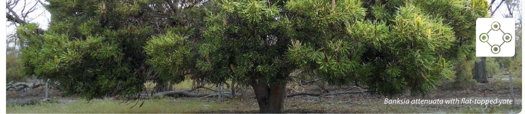
Banksia attenuata with flat-topped yate

Banksia attenuata , rock sheoak & jam wattle