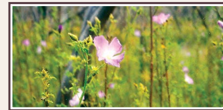
Native hibiscus Alyogyne huegelii is an example of a pioneer species that grows quickly, produces lots of seed, and is short-lived.