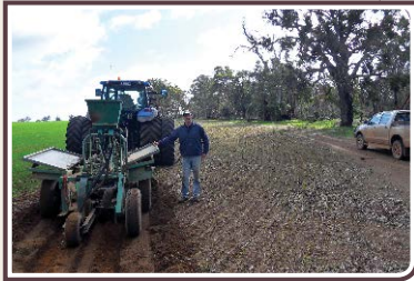
Broomehill farmer David Kinsey direct seeding with Chatfield Tree Planter with precision seeding attachment available from NSPNR.