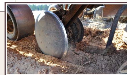
Soil preparation achieved with the CommVeg seeder. The machine was travelling from left to right and the image shows the view behind the scalper, showing clean dirt being ripped (spring tyne), small tillage disks and the first wheel of the floating seeder arm which places the seed and presses the seed sowing trench.