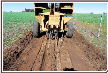
Chatfield Tree Planter available from Gillamii Centre drops seed on soil surface. Heavy chain aiming to cover coarse seed and fine chain to cover fine seed.