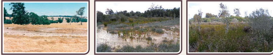
Sea rush Juncus kraussii thrives with upwelling of water in salt scald planted 1997 (left) showing recruitment 2012 (centre and right).