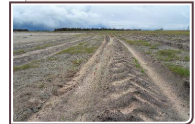
Mounding is needed on waterlogging-prone and saline soils. Contact NSPNR or the Gillamii Centre for availability of mounds.