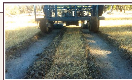
An ideal scalp created by the CommVeg seeder. 5-7cm of soil being removed from the centre of each scalp, grading to 0cm on the outer sides of each scalp line.

Some large seeds (e.g. Banksia ) do not germinate well at depth, and thus when legumes, larger seeded eucalypts and banksias are combined in a mix a sowing depth of 10-15mm is recommended. When sowing a simple legume mix (e.g. Kennedia species and Acacia saligna for forage) on light textured soils, sow seeds at a depth of 20-30mm.