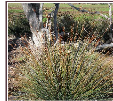
Spiny rush Juncus acutus shown in this photo is a nasty weed easily distinguished from native rushes by stiff, needle-sharp tips and fan-shaped foliage is easily removed while in low numbers by digging out. Rapidly regenerates and completely covers an area, eliminating all other species and becoming impenetrable to humans and stock 3 . Grows on wet areas including saline sites.

For example Acacia , Atriplex , and some eucalypts are extensively damaged by red-legged earth mite (RLEM). Many Melaleuca species (eg M. hamata ) are not damaged by RLEM. Beetle larvae, Rutherglen bugs, weevils can all cause extensive damage to native plants before and after emergence and through to the several leaf stage. Locusts, wingless grasshoppers, beetles, weevils and Rutherglen bugs cause damage after germination, during the following spring-summer. Seedlings of all species become resistant to RLEM damage once they have reached the 6 leaf stage and thus nursery raised seedlings are not normally damaged by RLEM. Controlling RLEM is usually not required for seedling only projects. Adding insecticides into the weed control spray mix delivers good results. Adding, for example, bifenithrin and glyphosate together to control insects and weeds 21-28 days prior to sowing is highly effective. A follow up application of insecticide is usually required 2-10 weeks after sowing, depending on the results of the initial insect control.