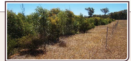
Planting across a slope provides windbreak as well as linking up two remnants at each end (left 2000, right 2006).