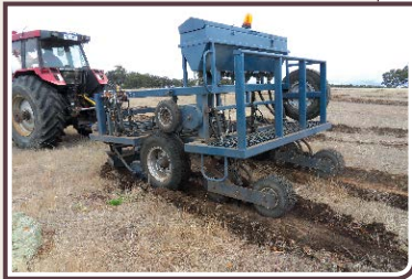
CommVeg seeder enables optimal seed placement, which is critical on light sandy soils that are unable to retain moisture around the seed. For more information contact NSPNR.

A common tree planter that is fitted with a small seeds box can be used to direct sow native seeds (e.g. a Chatfield Tree Planter). Such equipment can be used to scalp 50mm of topsoil (to remove weed seeds), make a shallow rip (20-30cm deep), and scatter seed on the freshly disturbed soil.