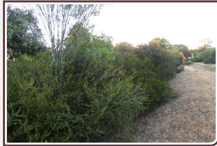
Diverse understorey species will create better habitat than dense stands of trees that outcompete understorey. Prickly shrubs such as Hakea prostrata (left foreground), as well as bushy shrubs such as one-sided bottlebrush Calothamnus quadrifidus (and right understorey) provide habitat for small birds and beneficial predatory insects.

Planning for revegetation needs to be undertaken in context with the objectives of the landholder and whole-farm planning. A few examples of objectives might be to stabilise soil such as salt scalds or gutless sands, to create linkages with existing bushland and habitat for beneficial fauna such as insectivorous birds, bats and predatory insects and possibly for fauna that you wish to attract back to your property, to make the place look and feel great and promote healthier ecosystem function!