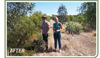
Before and after photos are valuable for monitoring change following revegetation activities.