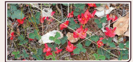
Ground cover running postman Kennedia prostrata (foreground) grows well from seed on gravelly soil.