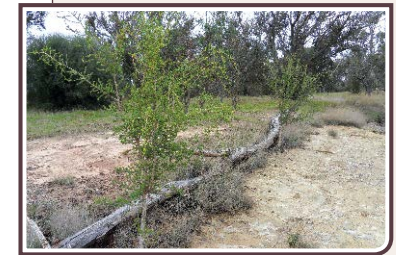
Woody debris including hollow logs are important to keep as trap soil, litter and seeds and provide habitat; helping to crank up 'islands' of ecosystem function in degraded lands.